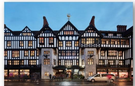
Liberty of London Shop

Breakfast Guided tour of Westminster Abbey & The Royal Mews Lunch Shopping in central London, Liberty, MacCulloch and Wallis, Fan New Trimmings, plus Hand & Lock Tours Dinner TBD Overnight Petersham hotel