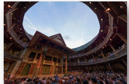
Shakespeare's Globe Theatre