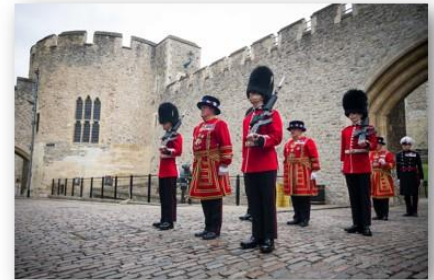
Beefeaters at the Tower of London

Breakfast Class with Heidi – 1 hours Depart for London – Guided Tour of Tower of London Lunch at Borough Market (Pay on Your Own) Tour at Shakespeare's Globe Theater Return to Richmond Farewell Dinner Overnight Petersham hotel