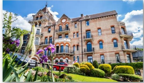
Petersham Hotel

Lunch TBD – possibly Petersham Nurseries Class with Heidi – location TBD Travel Block Diary Quilt High Tea at The Wolseley Overnight Petersham