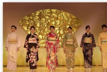
Nishijin Textile Center