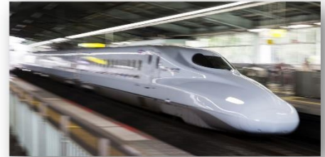
Bullet Train

Luggage Transfer to Kyoto Bullet Train to Niigata Northern Culture Museum Niigata Cuisine Lunch Kamedajima Shop Niigata Ginka Hakusan Shrine Toki Messe Observation Tower to View Japan Sea Chinese Dinner at Crowne Plaza Overnight at ANA Crowne Plaza Niigata