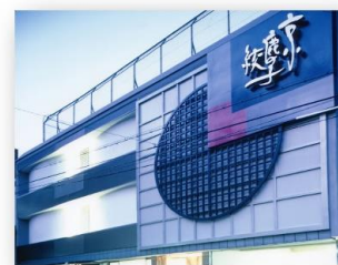
Shibori Museum

Yokota Factory Vegetarian Lunch at Daitokuji Temple Little Indigo Museum Tofu Dinner Overnight Princess Kyoto