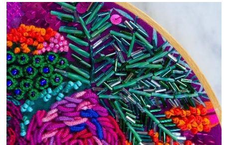
By Nichole Vogelsinger